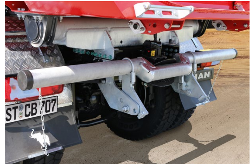
Offset underride guard folded up.