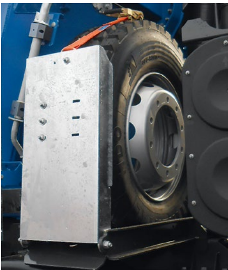
Quickly accessible spare wheel carrier in the winding version between driver's cab and body.

Schmitz Cargobull offers further accessories specifically developed for the tough demands of routine operations.