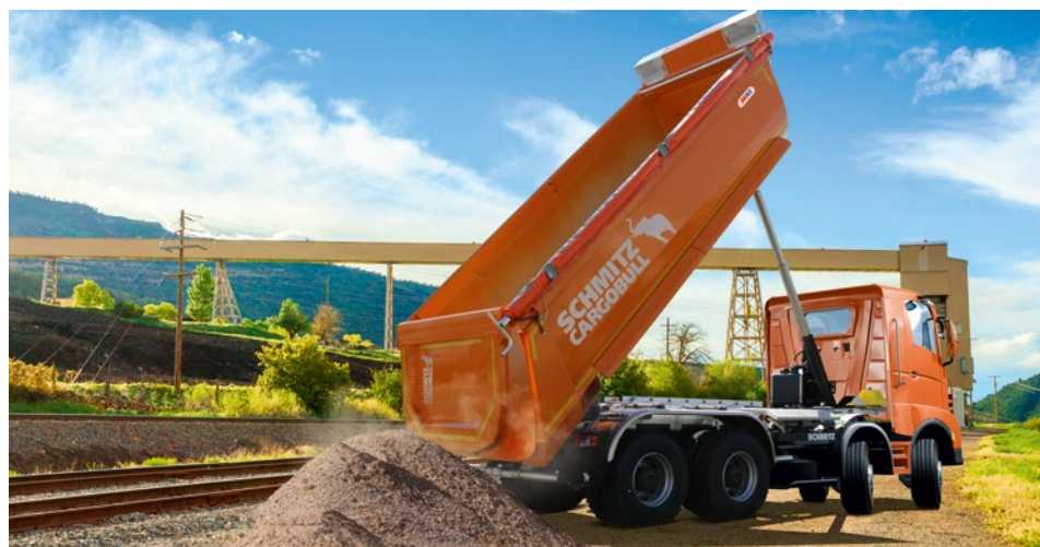
The wide floor area of the Schmitz Cargobull rounded steel body allows for a low trailer centre of gravity.