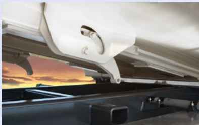
Automatic mechanical hook lock.

The locking devices on the body are robust mechanical devices that cope with tough daily work on construction sites. The hook lock has to be forcibly moved, guaranteeing maximum operational safety.