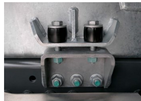
Elastic connection with silent sleeves.