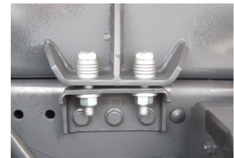
The subframe is mounted on the chassis according to the trailer manufacturer's assembly guidelines, here with disc springs.