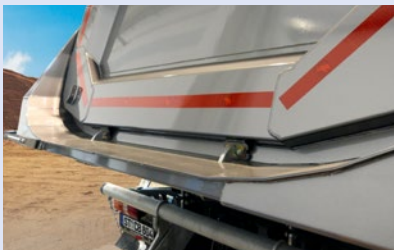
Locking hook on the tailgate.