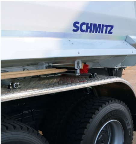
Side fender plates on the rounded steel body protect the area of the running gear, tanks, brake reservoir and batteries when loading.