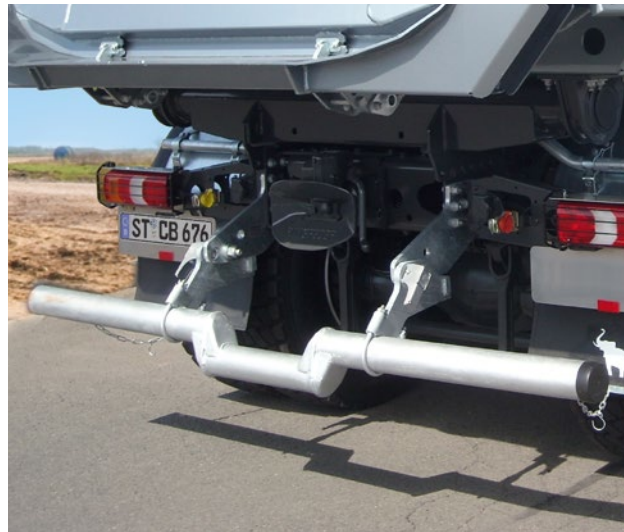
Optionally available: offset, folding underride guard for vehicles with trailer coupling.