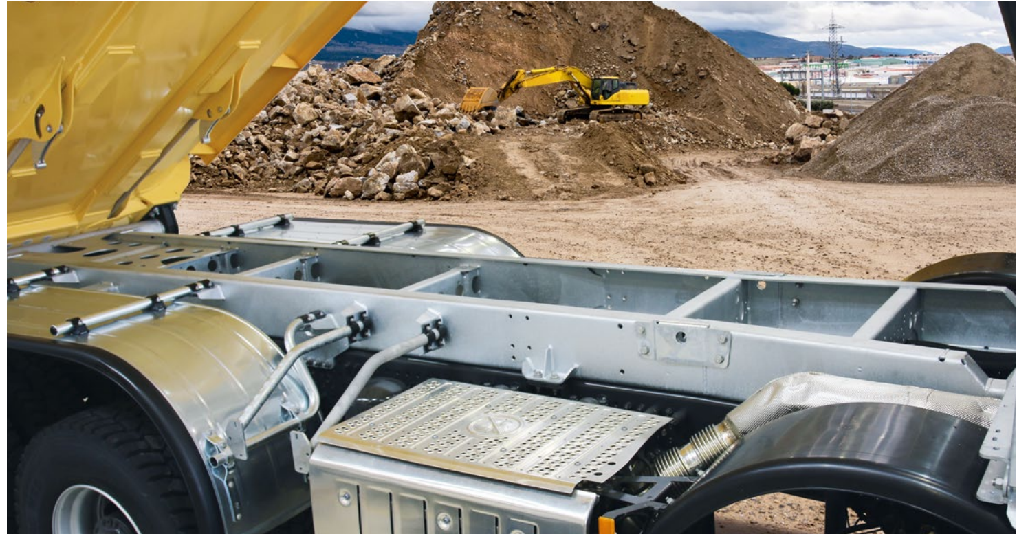
The highly torsion-resistant subframe transforms the vehicle and the body into a single extremely durable, safe and efficient unit.

The subframe is galvanised for corrosion protection. Alternatively, a high-quality painted version can also be ordered.