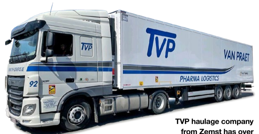
TVP haulage company from Zemst has over 160 trailers and 80 trucks.