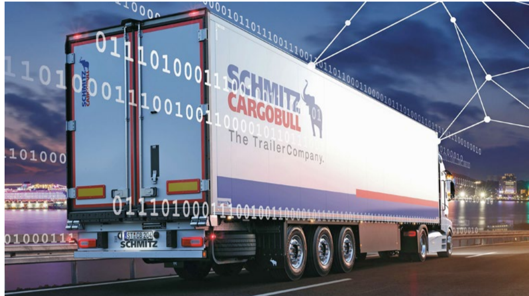
TrailerConnect® TourTrack facilitates the real-time tracking of individual routes.

With the TrailerConnect® Data Management Center, Schmitz Cargobull offers hauliers a solution that is tailored to their requirements. The platform provides an easy way to link every member of the supply chain and share data in a controlled and secure process. Furthermore, the