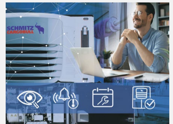
A helping hand for fleet managers: predictive maintenance uses artificial intelligence to simplify the planning of maintenance work.

This system allows for real-time monitoring and tracking of goods and high-value load carriers during transport. Bluetooth Low Energy Tags (BLE tags) are little electronic assistants that wirelessly transmit information to Schmitz Cargobull wireless receivers in the box body. When a BLE tag is attached to a shipping container or pallet cage located on the trailer, the wireless receiver receives this information, increasing the level of transparency in the supply chain. These tags also simplify inventory management and traceability, which reduces the risk of load carrier loss in the supply chain. For its semi-trailers, Schmitz Cargobull offers the option to have BLE receivers installed inside the vehicle. The read device then receives data from the BLE tag and sends this to the control unit of the TrailerConnect® telematics system. As such, users can check which load carriers are currently located on the trailer at any time. These load carriers can then also be forwarded to connected system partners via TrailerConnect® Data Management Center or TrailerConnect® TourTrack. This increases the transparency of goods and load carriers in the supply chain.